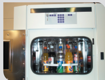
Special sample carousel in a Xenotest Beta+ to hold customary bottles