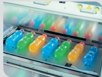
PET bottles in a SUNTEST XXL+ flatbed xenon exposure system